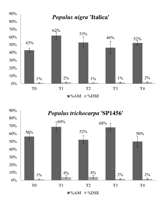
Figure 2. Percentage of colonization by arbuscular mycorrhizae (%AM) and dark septate endophytes (%DSE). Whiskers correspond to standard error, and middle points to mean. Letters indicate different homogenous groups calculated by Tukey's post-hoc test. T1: inoculated with Tausonia pullulans , T2: Candida saitoana , T3: endophytic bacteria, T4: mixture of microorganisms and T0: un-inoculated plants.