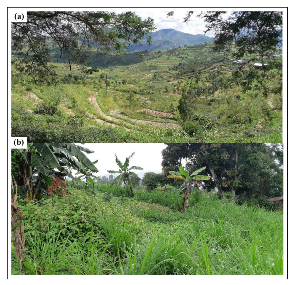
Figure 2. Napier grass grown on contours and terraces in Butare, Rwanda (a), and Napier intercropped with green peas in front, and Desmodium distortum with Napier grass in the background in Burera, Rwanda (b).

agroecological and socioeconomic contexts. Diverse forages can occupy different niches and fulfill different objectives in a given farming system. Skillful spatial and temporal integration into cropping systems, especially with food crops, is key in not compromising smallholders' food security and deliver multiple benefits (Ates et al., 2018; Rudel et al., 2015). The concept of socio-ecological niches refers to best-fit agricultural improvements that are adapted to the agroecological, sociocultural, economic, and institutional contexts (Descheemaeker et al., 2016b).