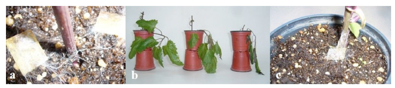
Figure 3. Results of target inoculations of Pseudogynoxis benthamii with Sclerotium rolfsii . a, Hyphal strands emerging from the inoculum plugs, and developing towards the substrate and the lower stem; b, from left to right: Control plant, and wilting infected plants 7 days from inoculation; c, hyphal growth around the stem base.

Sclerotium rolfsii usually infects the lower stem near the soil surface of many crops causing the disease known as Southern blight. Infections are favored by high temperature and moisture (Punja, 1985), which correspond to the environmental conditions before the disease was detected in this case. This is a widely distributed soil-borne species, but P. benthamii is not included in the 2,579 fungus-host records for Sclerotium rolfsii (Farr & Rossman, 2017). The pathogen can overwinter as mycelium in infected plants, plant debris, or as sclerotia. These data should to be taken into account when planning control measures. To the best of our knowledge, this is the first report of S. rolfsii on P. benthamii and the first pathogen anywhere reported on this plant species.