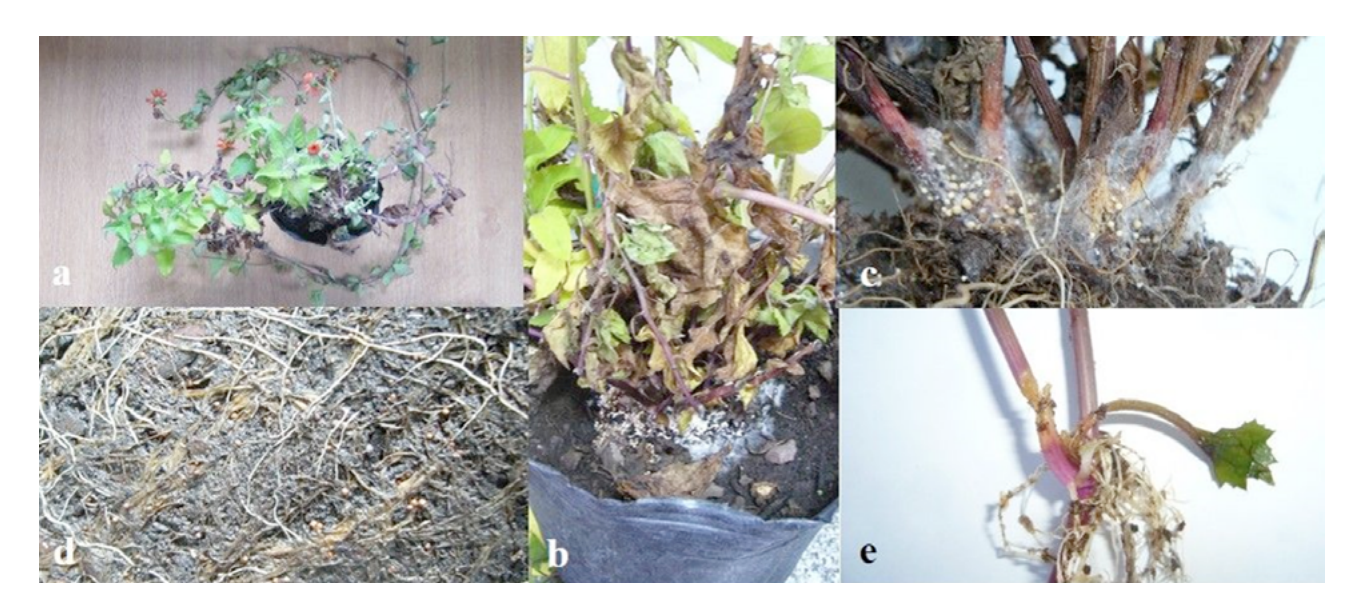
Figure 1. Wilt of Pseudogynoxis benthamii caused by Sclerotium rolfsii . a, Wilting plant, with the lower foliage turned brown, and hanging on the plant; b, advanced stage of wilt, showing the growth of the pathogen at the base of the plant; c, white mycelial mats colonizing the lower stems, and roundish sclerotia at different stages of development; d, plant eased out of the pot showing sclerotia formed in the substrate and near rooted roots; e, intense rot of the lower stem and roots.

The fungal isolate was cultivated on PDA at 25 °C and pieces of 1.7 cm<sup>2</sup> were cut from the edge of 5-days colonies with a scalpel. Pathogenicity was tested in a climatic chamber on twelve potted plants inoculated by placing 2 plugs of inoculum on the soil near the stem bases. For the control, 5 plants were treated with sterile PDA plugs. Each plant was enclosed in a transparent polyethylene bag, and incubated at 27 °C for 72 h. The plants remained in the chamber with natural daylight conditions. The test was repeated twice. To satisfy Koch's postulates, the fungus was re-isolated from symptomatic tissues. Following DNA extraction (Stenglein & Balatti, 2006), a PCR was carried out in an XP thermal cycler (Bioer Technology) to amplify the nuclear ribosomal DNA internal transcribed spacer (ITS) region using primer pairs ITS1 (5'-TCC GTA GGT GAA CCT GCG G-3') / ITS4 (5'-TCC TCC GCT TAT TGA TAT GC-3') (White et al. 1990). The sequence fragment was compared with BLASTn (Altschul et al., 1990) to publicly-available sequences deposited in GenBank. The sequence was subsequently submitted to