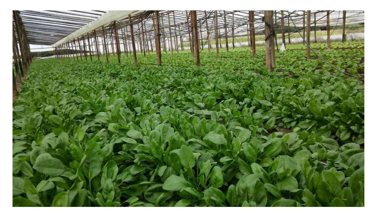
Figure 5: Spinach crop in bio-solarizated soil. Johny Valverde farm in Escobar, Buenos Aires province, Argentina.