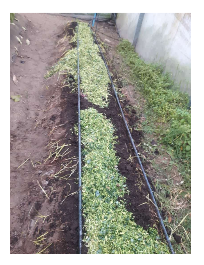
Figure 3: Broccoli residues distributed in a greenhouse of La Plata.

Figure 2: Chipping of broccoli residues in La Plata.