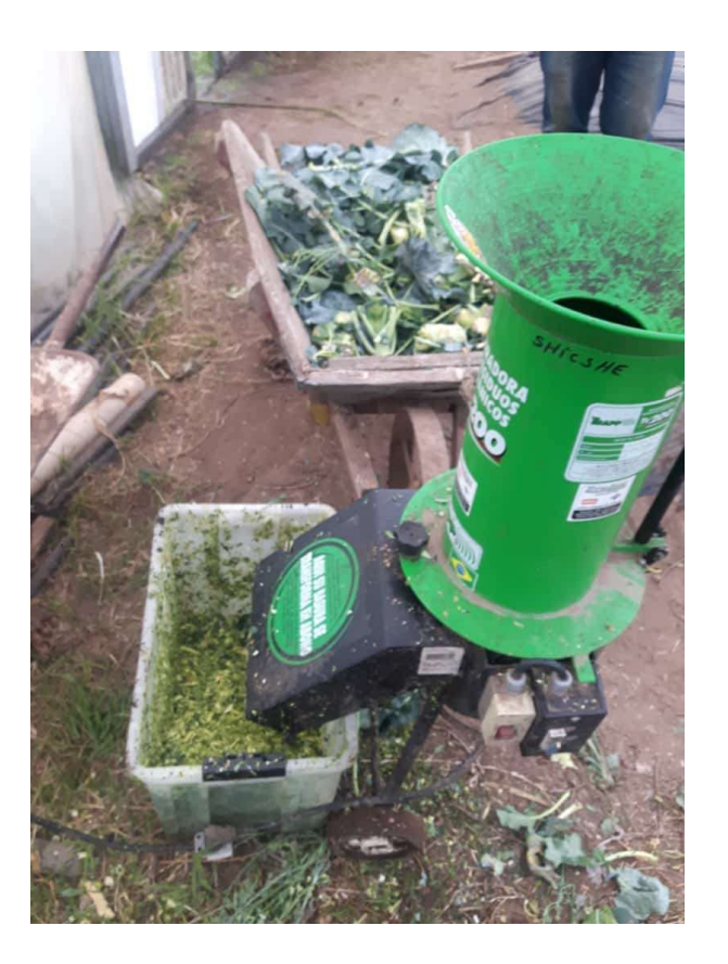
Figure 2: Chipping of broccoli residues in La Plata.