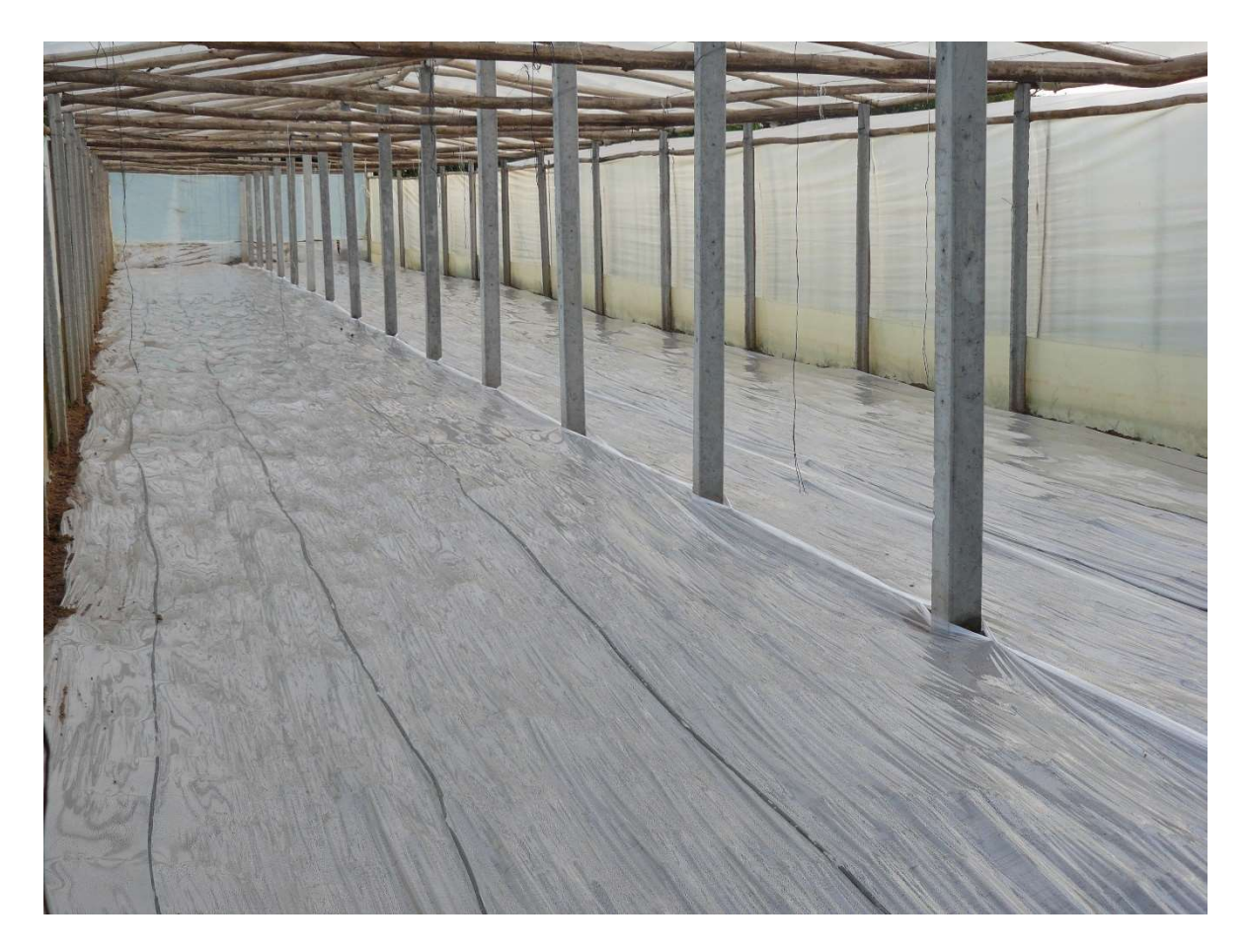
Figure 1: Bio-solarization in a greenhouse of Corrientes province.

Horticultural crops in Argentina are produced along a wide territory under very different climatic conditions. Biofumigation has been assayed mostly under protected cultivation where intensive use of soil originates high populations of nematodes and soil-borne pathogens. Positive experiences have been held in Jujuy, Salta, Corrientes, Entre Ríos, Tucumán, Mendoza, Córdoba, Río Negro, Neuquén, La Pampa, etc. These practices have been successfully implemented, allowing the disinfection of soils in a sustainable manner. Biofumigation has proved to be much more effective when combined with solarization. Solarization has been adopted especially by farmers in regions in the northeast and northwest of the country where hot conditions in summer (mainly during January) make it impossible to cultivate into the greenhouse. These farmers add manure to the soil prior to solarization, so they perform bio-solarization (solarization + biofumigation) treatment in most cases. In Corrientes, a subtropical province specialized in off-season production in more than 1700 has of greenhouses, incorporation of chicken and cattle manure into the greenhouse soil prior to solarization was effective against Ralstonia solanacearum, Pythium aphanidermatum, Rhizoctonia solani , and Sclerotium rolfsii . Other biofumigants essayed were pine tree fallen leaves, grass, cabbage and sorghum [1-5] (Figure 1 ).