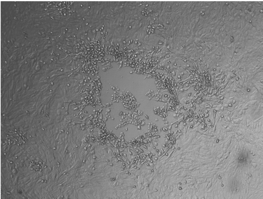
Fig 1. Cytopathic effect induced by BoHV-4 strains from bovine ovary batches on MDBK cells. Cytopathic effect associated with BoHV-4 infections. Light microscope (10X).

Phylogenetic comparisons with previously described BoHV-4 sequences indicated that the strains obtained from the bovine ovaries collected at slaughterhouse belonged to Genotype 1.