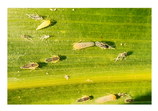
FIGURE 3 Abundant populations of the corn leafhopper ( Dalbulus maidis ) observed on sweet corn leaves.