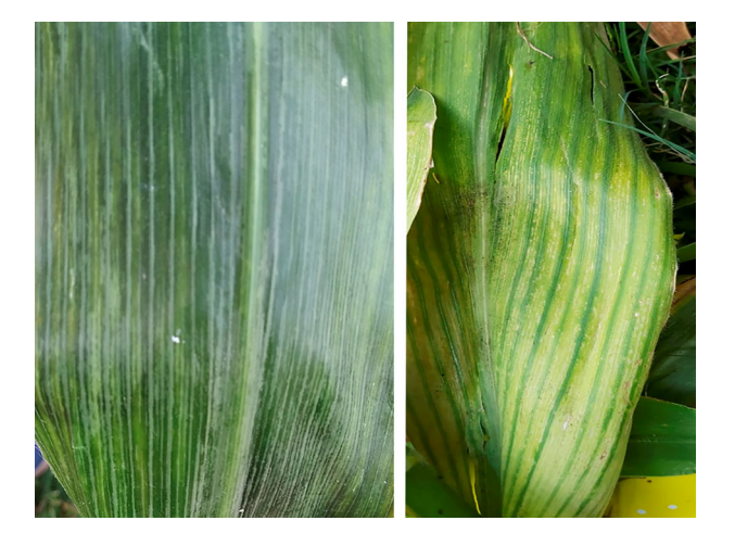
FIGURE 2 Symptoms of vein thickening (left) and interveinal yellowing (right) observed in the field in Helevecia, Santa Fe province, Argentina.