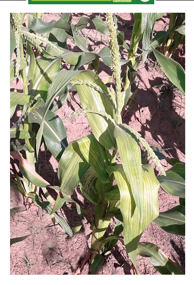
FIGURE 1 Severe stunting symptom observed in the field in Helevecia, Santa Fe province, Argentina.