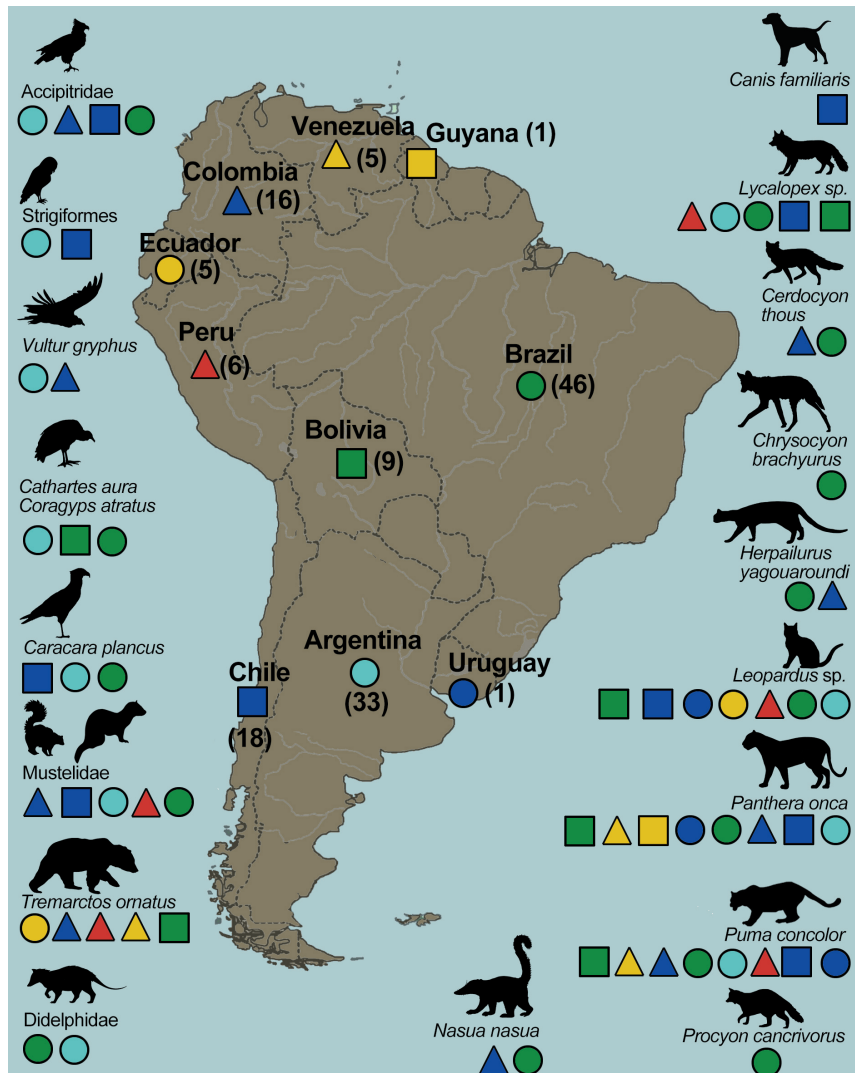
Figure 2. Map of species involved in negative interactions between humans and wildlife, showing the countries where the studies were performed. The different countries are represented by geometric symbols and the numbers in parentheses indicate the quantity of articles published in each country.

Figura 2. Mapa de las especies implicadas en las interacciones negativas entre el ser humano y la fauna silvestre, en el que se muestran los países donde se realizaron los estudios. Los diferentes países están representados por símbolos geométricos y los números entre paréntesis indican la cantidad de artículos publicados en cada país.