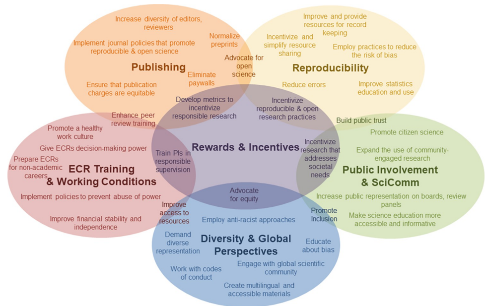
Fig 1. Themes of scientific reform efforts. Common themes of science reform work include publishing, reproducibility, public involvement and science communication, diversity and global perspectives, ECR training and working conditions, and rewards and incentives. This figure provides a general overview of some themes included in each topic and overlapping areas. It is impossible to display all themes and overlapping areas.

https://doi.org/10.1371/journal.pbio.3001680.g001