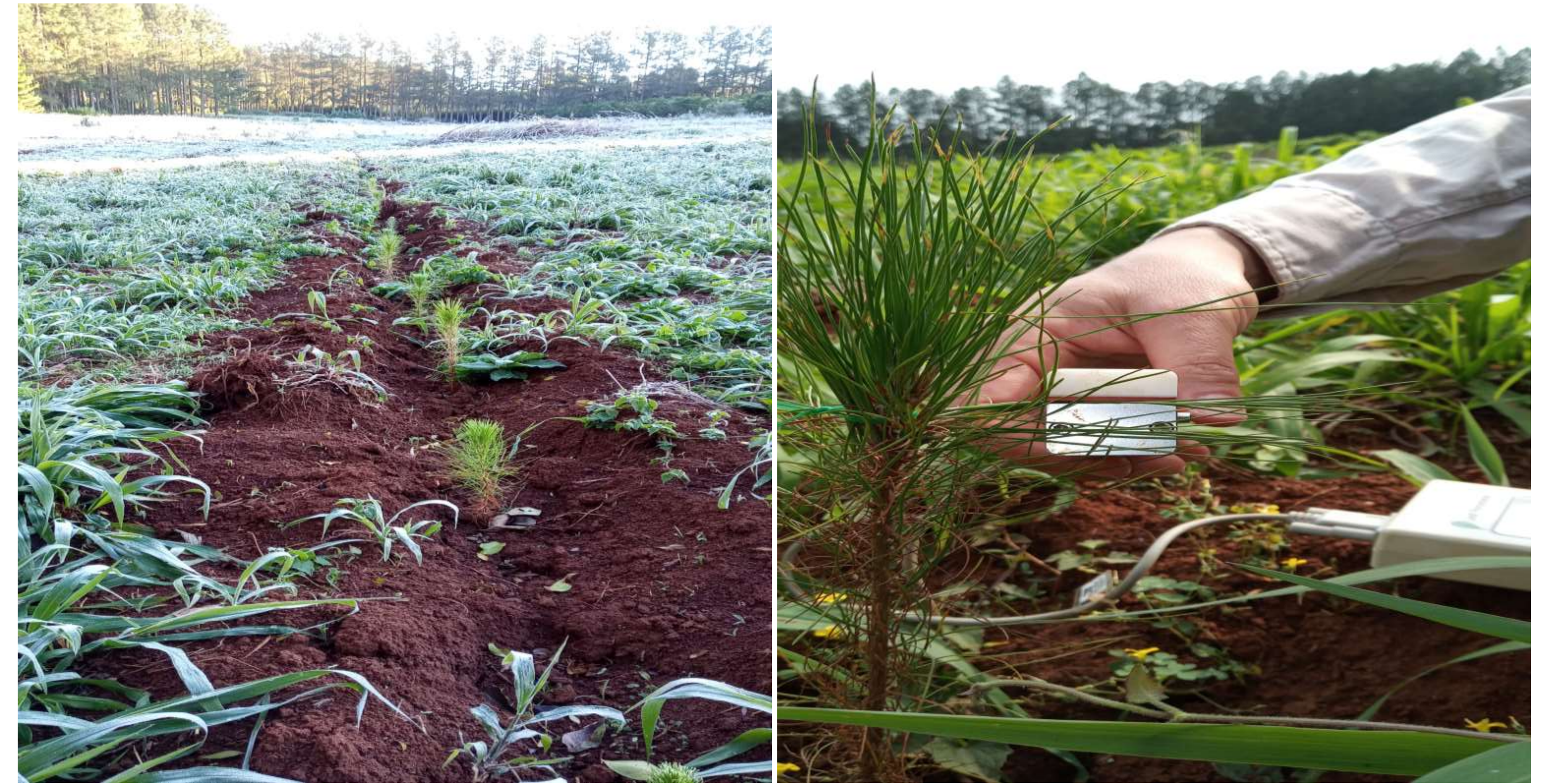
Figure 1: Size initial of hybrid pine in August 2020 (left picture). Measure of stomatal conductance in November 2020 (right picture).

Family stomatal behavior was not related to initial size and morphological dynamics, which could be related to a differential allocation to aboveground vs. belowground biomass or to differences in resource use efficiency.