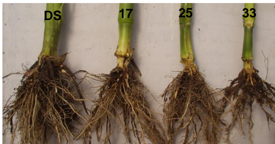
Fig. 2. General appearance of the root systems in sweet corn plants in experiment 6, cv. 'Butter Sweet' at harvest time for direct sowing and of 17, 25 and 33 days-old transplants (from left to right, respectively).

These results lead to a general recommendation for growers considering switching to smaller cell sizes or older seedlings: they should do so with caution. Compared to direct sowing, sweet corn transplants grown in a smaller container or aged seedlings may produce lower and later yields.