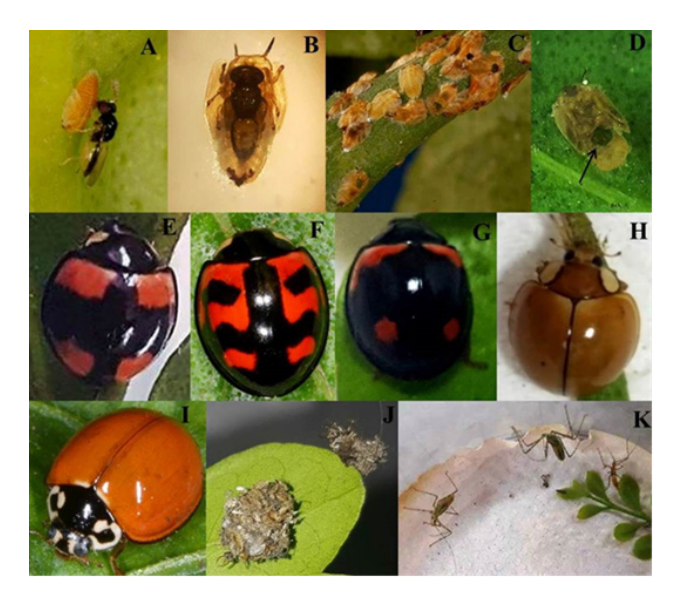
Figure 1. A. Adult of Tamarixia radiata host-feeding on a nymph of Diaphorina citri . B. A fully developed adult of T. radiata ready to emerge from a 5<sup>th</sup> instar nymph of D. citri . C. Exit holes of T. radiata on D. citri mummies. D. A possible exit hole of Diaphorencyrtus aligarhensis . E. Cheilomenes sexmaculata , morph 1, F. Cheilomenes sexmaculata , morph 3, H. Paraneda pallidula guticollis , I. Cycloneda sanguinea , (Coleoptera: Coccinellidae), J. Larvae of Ceraeochrysa sp. (Neuroptera: Chrysopidae). K. Nymphs of the assassin bug, Zelus sp. (Hemiptera: Reduviidae).

Immature and adult predators that were found preying on D. citri on the host plants were collected and taken to the laboratory. For identification purposes, the larvae of the collected predators were reared in the laboratory until adult, providing nymphs of D. citri . Pupae of predators found on the