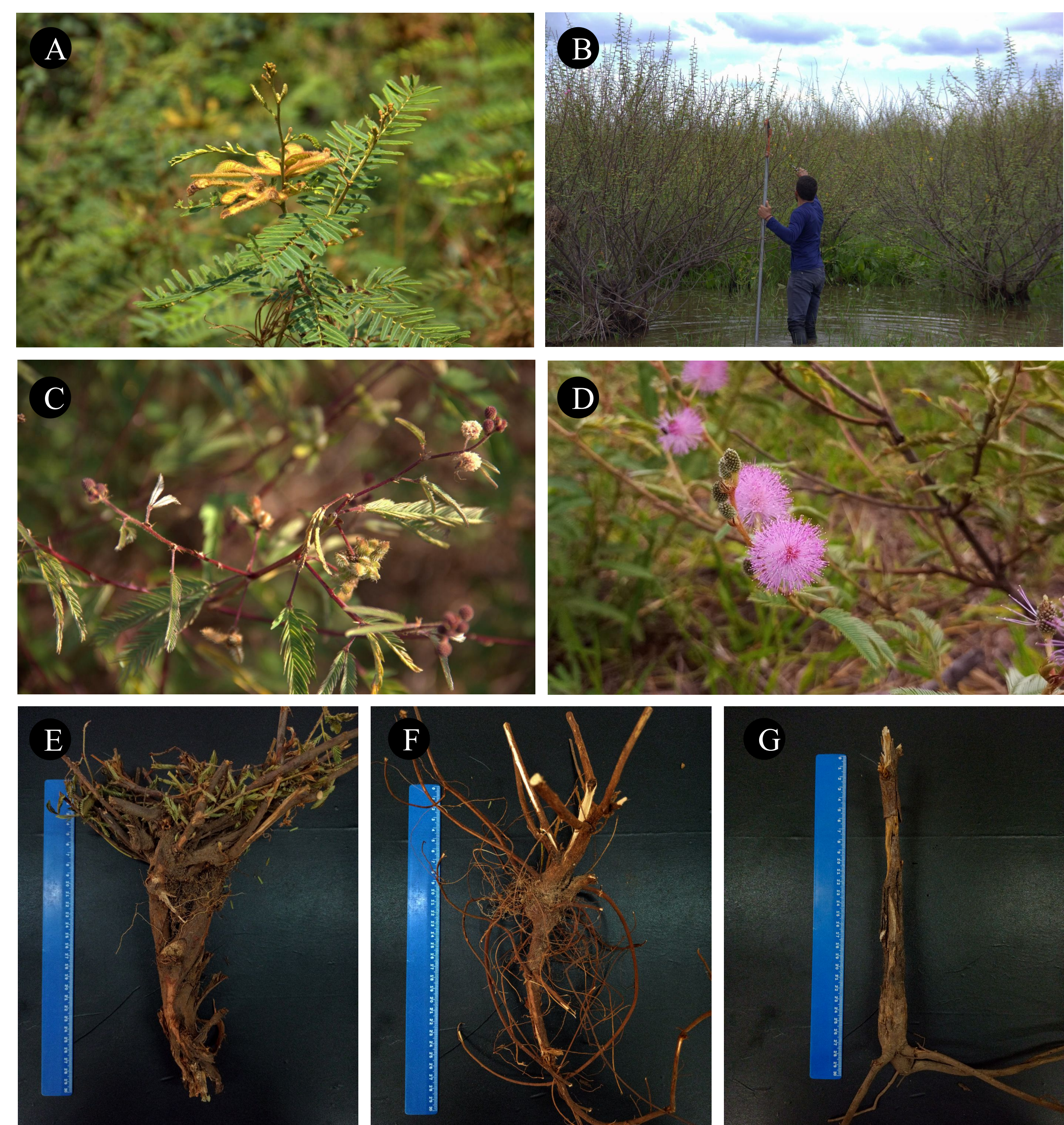
Figure 2. Examples of species resilient to the flooding and fire. A - M. pigra var. pigra ; B - M. weddelliana Benth. in temporary ponds; C - M. polycarpa var. spegazzinii ; D - M. xanthocentra var. xanthocentra ; E, F, G - Underground structure on M. weddelliana , M. xanthocentra var. xanthocentra and M. polycarpa var. spegazzinii , respectively.

Among the 45 taxa of Mimosa in the Pantanal ecoregion, 27 taxa were present in flooding environments, such as swamps, temporary ponds, and riparian forests. Considering the fire events, 21 taxa showed resilience to this ecological filter in areas with a history of periodic fires that usually occur in the dry seasons of the year.