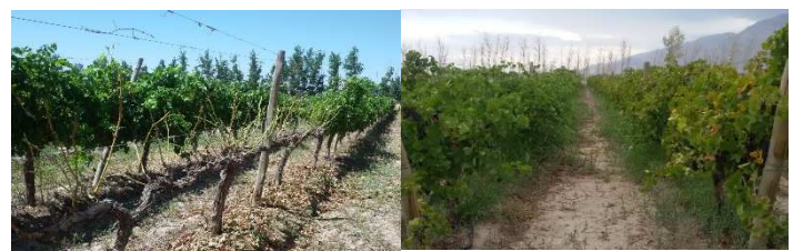
November prune CF1

The experimental design was complete randomized, with 4 repetitions.