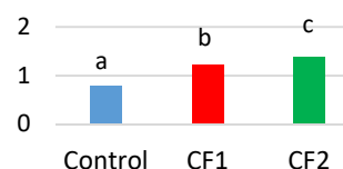
Figure 1: a) Anthocyanins content b) Total polyphenol index, c) Color intensity in wine in control and treatments. Different letters means significative differences by Tukey test. ( p \leq 0.05 )