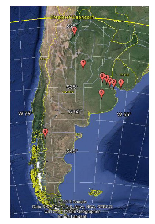
Figure 1. Geographical distribution of premises affected during equine influenza outbreaks in Uruguay and Argentina in 2012. (1) Maroñas, (2) La Plata, (3) Palermo, (4) San Isidro, (5) San Antonio de Areco, (6) Azul, (7) Córdoba, (8) Tucuman and (9) Esquel.

The phylogenetic analysis of HA1 gene sequences of 18 EI viruses detected in South America indicated that all of them belong to clade 1 of the Florida sublineage of the American lineage (Figure 2) and are closely related to viruses isolated in the United States in 2012.