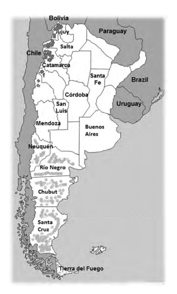
Figure 1. Map of Argentina, including provinces relevant in camelid fibre production or named in the text. Areas with llamas and vicuñas are dark shaded and correspond to " Puna " highland environments of Northerm provinces. Areas with guanacos are light shaded and correspond to " Pataeonia " desert environments of Southern provinces.

The last national livestock census dates the year 2002 and indicates that there were 161 402 llamas in Argentina (INDEC, 2002). About 68 percent of that population was located in the province of Jujuy, 16 percent in Catamarca, 12 percent in Salta and only 4 percent in other provinces (Figure 1). A survey of 2008 in the North-Western Departments of Jujuy indicated that the llama population had increased since 2002 by 40 percent, largely at the expense of sheep (Roisinblit, 2011) and a study by FAO (2005a) shows that herd size of llamas is larger than reported in the census of 2002. It is estimated that the number of llamas by 2014 is at least 200 000 heads, with more than 90 percent reared in the Andean Puna. The Puna is a natural rangeland environment above 3 000 m above sea level occupying much of the province of Jujuy and parts of Salta and Catamarca. One can still find llamas in other, lower altitude and regions of the country, but these are likely to be in commercial or hobby farmer herds rather than in smallholder - low-input systems. It is generally accepted that there are no alpacas (Lama pacos) in Argentina. However, given that there are alpacas in contiguous environments of Chile and Bolivia, there may well be some