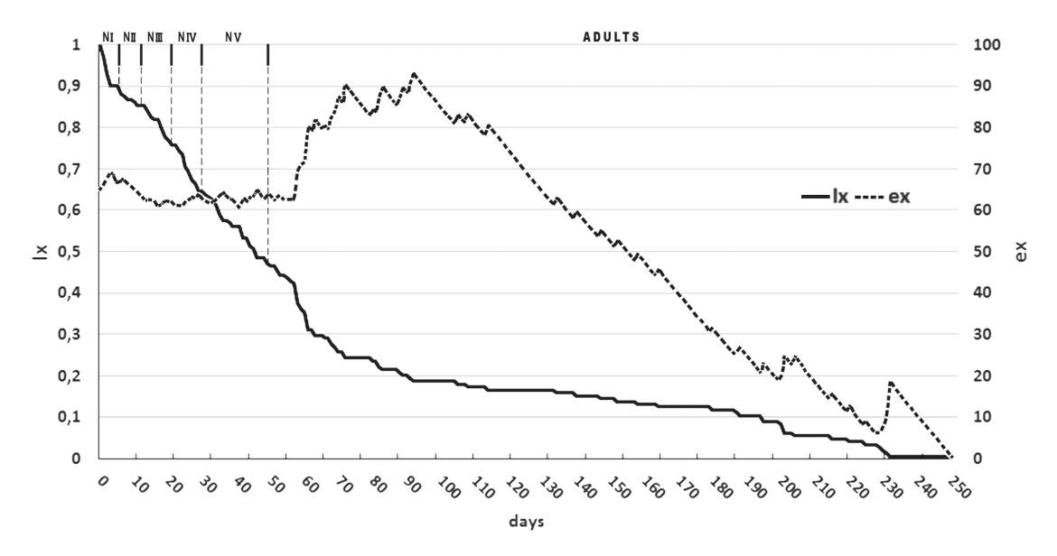
Fig. 2. Survivorship (lx) and life expectancy (ex) curves of Ceresa nigripectus Remes Lenicov reared on alfalfa plants at 27 ± 2 °C, 60-80% RH and 16:8 H L:D artificial light photoperiod. In addition, the mean duration of each stage is shown. (NI - NV: nymphal instars).

treehopper were tended by the ant Camponotus punctulatus Mayr (Hymenoptera: Formicidae), but no predatory attacks on the treehoppers were noted; the ants were observed feeding also on alfalfa nectaries. In this contribution, new distributional data of C. nigripectus is given for Manfredi (Córdoba province).