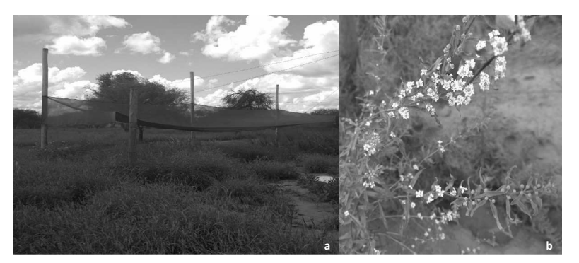
Figure 4. L. integrifolia in vitro regenerated plants reintroduced in their natural habitat (Province of La Rioja, Argentina). a) Plants growing in field conditions. b) Flowering branch of an in vitro regenerated individual.

bands. Table 4 shows the percentage of polymorphism, number of loci and number of private bands obtained with each primer. The size of the amplicons ranged between 290 and 2630 bp. As an example, Figure 5 shows the amplification products profiles obtained with the primers 5'GT (Figure 5a) and 3'TC (Figure 5b).