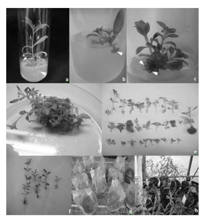
Figure 1. In vitro progress of L. integrifolia. a) Nodal segment cultured on free PGR MS (adventitious roots arrowed). b) Nodal segment cultured on MS + 2.2 \mu M BAP after 10 days (early callus arrowed). c) Evolution of the explant cultured on MS + 2.2 \mu M BAP (de novo shoots arrowed) after 30 days. d) Proliferation of new shoots in an explant cultured on MS + 2.2 \mu M BAP after 45 days. e) 28 shoots recovered from one explant cultured on MS + 2.2 \mu M BAP. f) Plantlets after the rooting step. g) Acclimatization phase. h) Viable ex vitro plants growing under standard greenhouse conditions.

Table 2. Multiplication rate (average number of shoots per explant) obtained after 45 days of culture with different concentrations of BAP. Different letters indicate differences between treatments (Tukey test, p < 0.05). Means \pm SD.