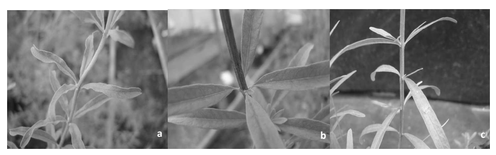
Figure 3. Differences in the number of leaves per node of an individual from in vitro culture without BAP (a) and an individual from in vitro culture with BAP (b) and the mother plant (c).