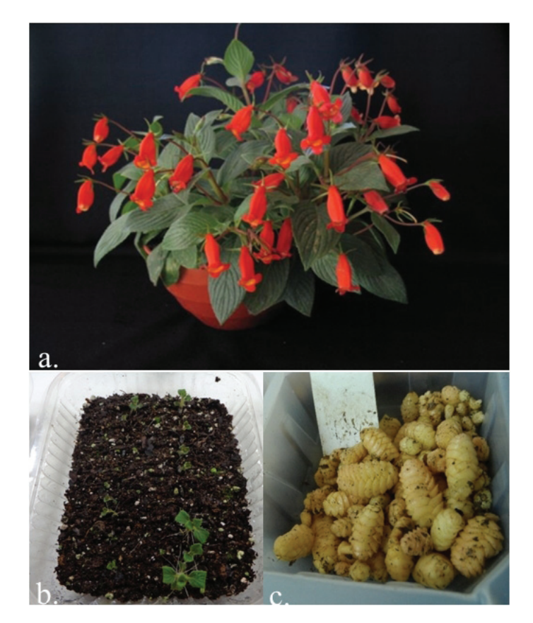
Figure 1. a) Seemannia hybrid. b) Sprouted scales grown in chamber. c) Rhizomes of the hybrid.

Plants of a selected hybrid between S. gymnostoma and S. nemathantodes from the breeding program that the Institute of Floriculture of INTA-Castelar (Argentina) carries out, were used for the assay. The hybrid was selected by its compact phenotype and intense red flowers (Figure 1a). The plants were obtained previously by cultivation of the scales in a breeding chamber with humidity and controlled temperature (22/24 °C day/night temperature, 16 h light cycle) (Figure 1b).