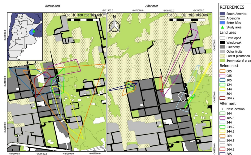
Fig 2. Location of the MCPs observed in both monitoring stages. The different foraging areas of the B. pauloensis queens before (before) and post- (after) the establishment of their nests are detailed. References: Land uses, LU categories included in the landscape use analysis; Before and After nest , in each case, the code used for identified each individual corresponding to the radio frequency of ATS Series A2412 transmitter.

The pollen present on B. pauloensis queens ( n = 44 ) captured inside the blueberry fields during the whole flowering of the var. Emerald, was from 54 plant species and did not differ across the time of the blueberry flowering ( H = 3.58 , p = 0.165 ). During the peak flowering of blueberry fields, the bumblebees focused their foraging on this mass flowering resource, but by the end of the blueberry flowering, other floral species increased their importance as resources for the bees. Plant species Conium maculatum L., Buddleja stachyoides Cham. & Schtdl. and Nothoscordum arenarium become more important and are collected more by queens of B.