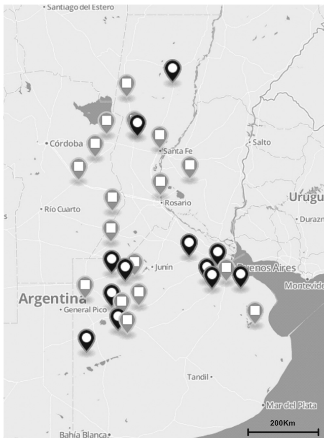
Figure 1 The total number ( n=137 ) of S. uberis isolates recovered from bovines suffering from subclinical or clinical mastitis were from 35 dairy farms located in the main dairy region of Argentina (black and gray globes). Gray globes indicate geographical origin of isolates selected for the sua and pauA sequencing.

of cows suffering from subclinical or clinical mastitis in Argentina and to assess the prevalence and conservation of the pauA and sua genes.