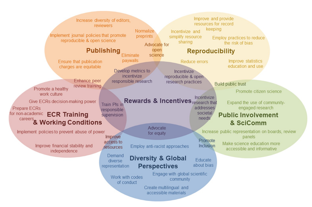
Fig 1. Themes of scientific reform efforts. Common themes of science reform work include publishing, reproducibility, public involvement and science communication, diversity and global perspectives, ECR training and working conditions, and rewards and incentives. This figure provides a general overview of some themes included in each topic and overlapping areas. It is impossible to display all themes and overlapping areas.

https://doi.org/10.1371/journal.pbio.3001680.g001