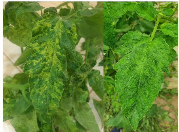
FIGURE 1 Leaf mosaic and mottling symptoms caused by Tomato brown rugose fruit virus in tomato.

One leaf sample from each of the three sites was collected and tested for Cucumber mosaic virus , Pepper mild mottle virus (PMMoV), Tobacco mosaic virus (TMV), Tomato spotted wilt virus and ToBRFV with ImmunoStrip® tests (Agdia, USA). Only the tests for PMMoV, ToBRFV and TMV were positive. Due to cross-reactions observed for these serological test kits, a tobamovirus RT-PCR assay (Maroon & Zavriev, 2002) was performed and the PCR products were sequenced (GenBank Accession No. OR225613). The RT-PCR confirmed infection with a tobamovirus; sequence analyses showed that the amplicons from all three leaf samples had 99% sequence identity to ToBRFV (OM515256.1). To demonstrate pathogenicity, symptomatic leaves