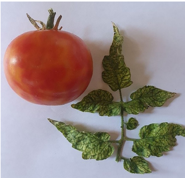
FIGURE 3 Blotchy ripening symptoms caused by Tomato brown rugose fruit virus in tomato fruits.

Phytosanitary measures, including tool disinfection, roguing of symptomatic plants and delimitation of quarantine areas, were implemented in the affected greenhouses to prevent the virus from spreading. Santa Lucía and Lavalle are the most important areas of tomato production in Corrientes, therefore during the next production season, field monitoring will be conducted and samples collected for further analysis. To our knowledge, this is the first report of ToBRFV in Argentina.