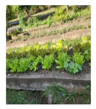
The site would be managed by farmers of Gideon Force farm with collaboration from water services and agricultural extension officers from the Department of Agriculture in the Ministry of Agriculture.

Persons on the island have expressed interest in developing back yard garden initiatives, starting with a pilot at the Mayreau Government School. This has commenced and is an ongoing Hydroponics Initiative. However, a critical component of this is water storage. Thus, the funds allocated by the