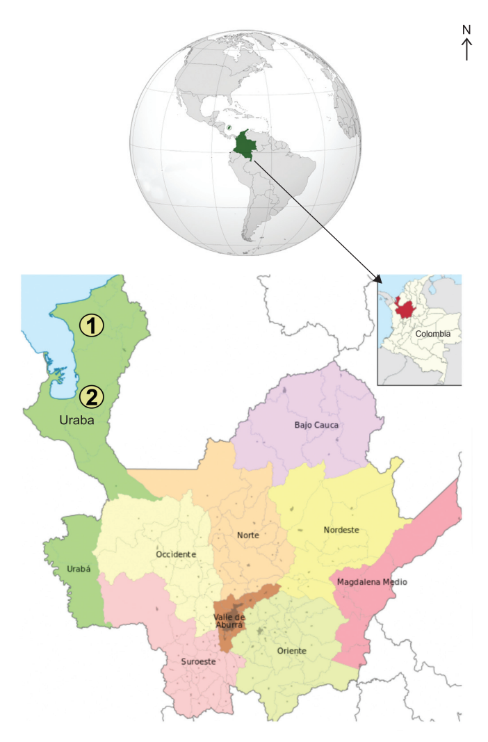
Fig. 1: Location of sampling sites in the Urabá region (green area), Antioquia, Colombia—① Necocli; ② Turbo.

Sample size (n) for bovine and human populations was estimated according to Lwanga et al <sup>18</sup> and using the Epidat program (version 4.1), on the basis of the following data/criteria. For bovines: Total population = 280,767 (records of the Department of Agriculture of the Department of Antioquia in 2014 for both towns<sup>16</sup>), prevalence of babesiosis = 13.65% (the median of frequencies reported in Colombia<sup>9, 19</sup>; and sampling error = 5%. For humans : People related to livestock activity<sup>16</sup> = 2559; prevalence