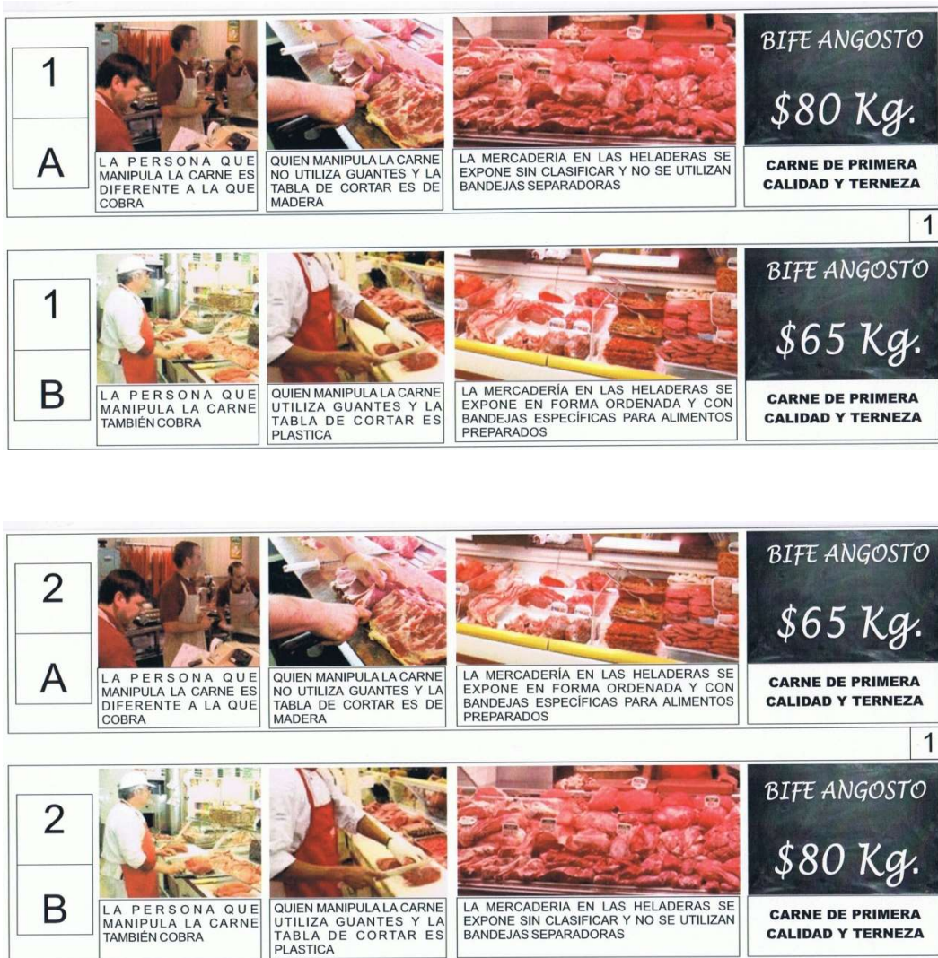
Figure 1 – Example of two of the choice sets included in the CE

Note: The Spanish text in the pictures describes the choice attributes.